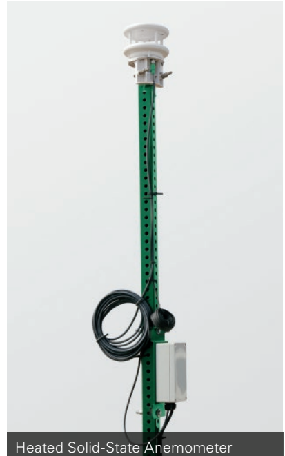
Heated Solid-State Anemometer