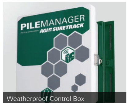
Weatherproof Control Box